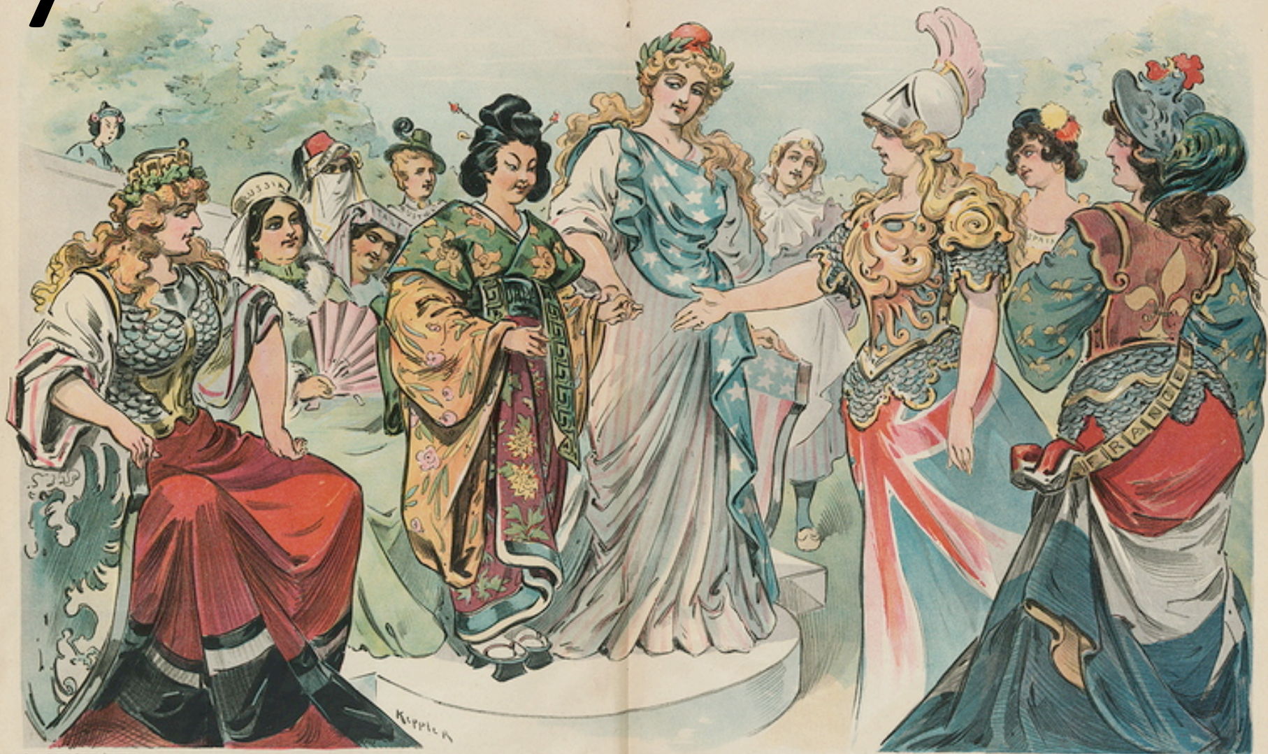
JAPAN MAKES HER DÉBUT UNDER COLUMBIA'S AUSPICES.